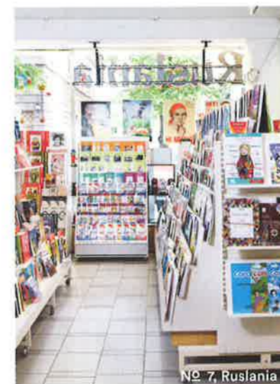
No 7, Ruslania

◆ Sinebrychoff Park and the Sinebrychoff Art Museum. The lungs of Punavuori. Bulevardi 40. sinebrychoffintaidemuseo.fi