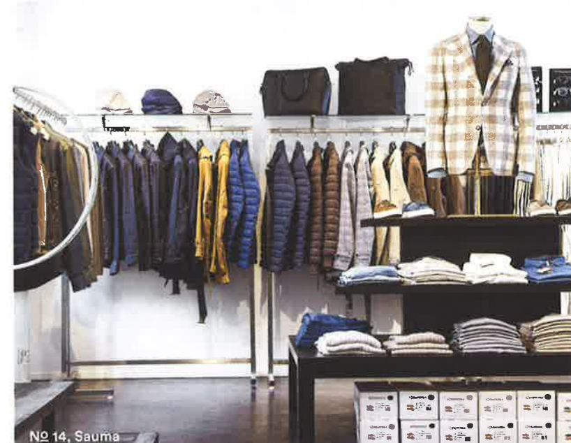
No 14, Sauma