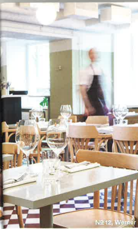
No 12, Werner